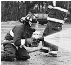
Granite Leisure Time Physical Challenge

remote cars on a difficult course and then went outside to real physical challenges. To give you an idea, each team member had to get into full fire gear and holding a fully charged heavy fire hose, knock over a target. Not an easy task for a tiny girl working hard next to a football player but they all did it. Whew, the first week was done and everyone survived. We all looked forward to the next Saturday.