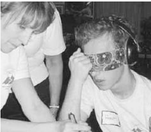
Point Afta Food Challenge

The last and final Saturday the final four were whisked off to Fortin's Home Furnishings for a memory challenge. They were assigned a color, and the items in the store that were flagged with that color they had to remember and run to a table in the parking lot to write down their items. When the first student was done it was off to the Point Afta for a food challenge. Blindfolded, they had to taste an array of food samples that all had been pureed to the same consistency... pureed hot dog... AWFUL! Once they had guessed ten out of twelve foods correctly they were driven to the last and final challenge. At the Winslow fire station (very appropriate) they had to light a flame with flint, ignite twine held between two poles until the fire broke through