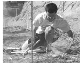
Winslow Fire Station Challenge